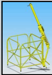
4 sided Barricade 42" IN-2108