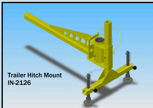
Trailer Hitch Mount IN-2126

The trailer hitch mount system connects to most 2" square vehicle receiver hitch. This most Popular system offers you screw side adjustable pads for uneven ground. Adjustable to fit a wide range of hitch height. Again Innova is offering you the most universal system on the market always using same Mast IN-2003, same Davit Arm IN-2002. It's gives you a maximum capacity of 360lbs (safety factor 10:1).