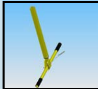
Adjustable T-Bar Leg for Pole Hoist" IN-2127